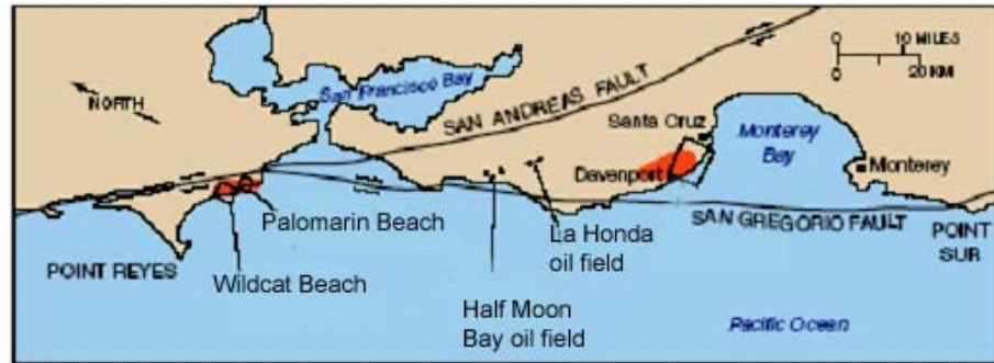
Approximate area of oil-bearing sandstone intrusions in Santa Cruz Mudstone and Monterey Formation