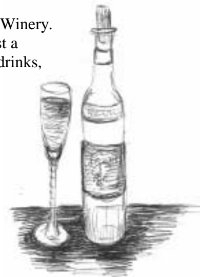
Artwork by Ami Jaqua

Thomas Fogarty Winery 19501 Skyline Boulevard (2.7 miles north of Page Mill Road, across from the entrance to Yerba Buena Nursery)