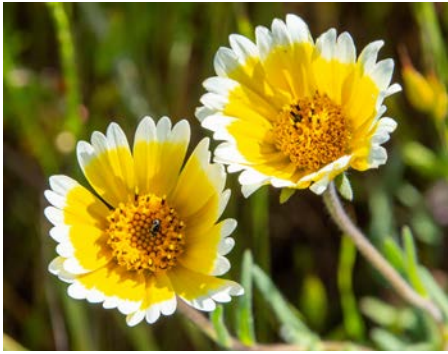
Tidy Tips with Tiny Beetle by David Schoen

Tidy-tips ( Layia platyglossa ) are an annual sunflower, growing mainly in grasslands. Their stems can be upright or prostrate, generally reaching a height of 6 to 12", or reportedly up to 2' tall. Wildflower enthusiasts are always happy to see them. "Oh look! Tidy-tips!" is often heard at the day's first sighting.