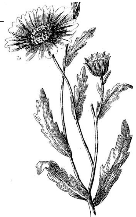
Tidy Tips Parsons 1906

From a distance, large stands of tidy-tips can appear as a solid pale yellow, the yellow and white colors melding into one and looking like something else. I myself have been fooled more than once and it always helps to take a closer look.