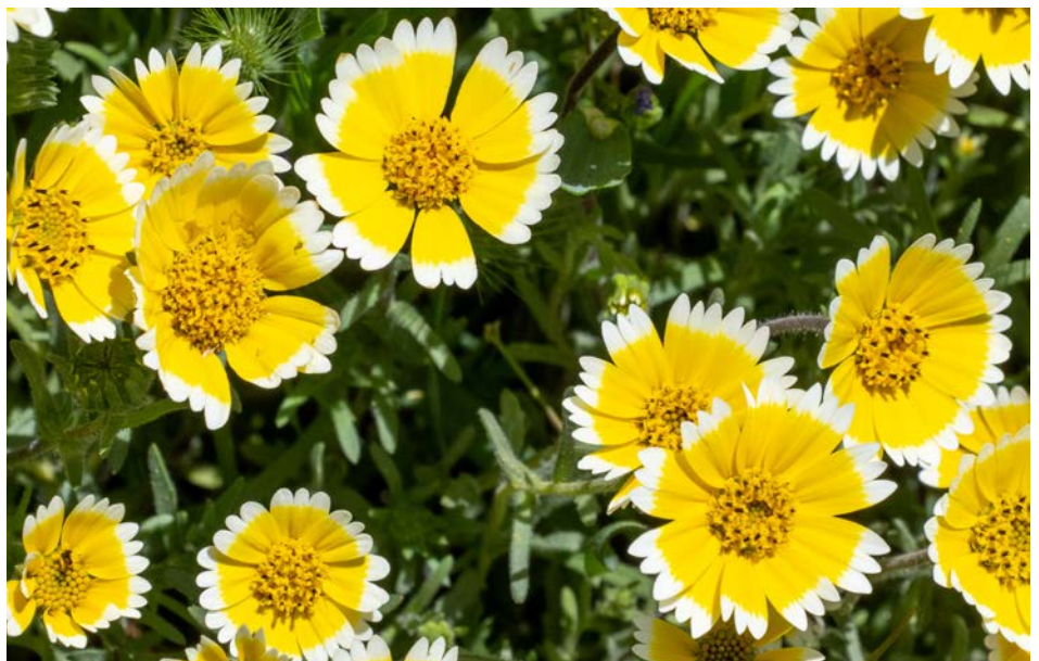
A Field of Tidy Tips

Tidy-tips are found mostly in California along the coast, coastal mountains, and into the Central Valley from Mendocino and Tehama Counties south into Baja California. They grow below 6000' in full sun.