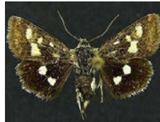
Heliothodes diminutivus National Museum Actual Width 15-19 mm

Tidy-tips are nectared by butterflies and pollinated by a number of insects. Along with other small sunflowers, they are a likely larval host for the tiny Heliothodes moth ( Heliothodes diminutivus ). The seeds are readily eaten by birds.