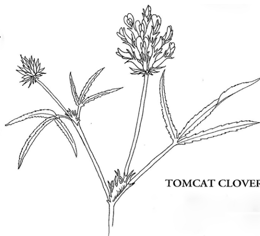
Tomcat Clover (Keator 1994)

The flowers of pea family members have a similar